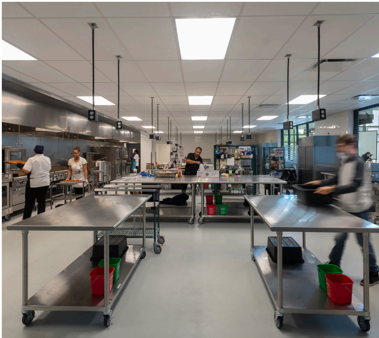
The Hatchery

Neighborhood Job Creators - Community Facilities - Grocery Retail