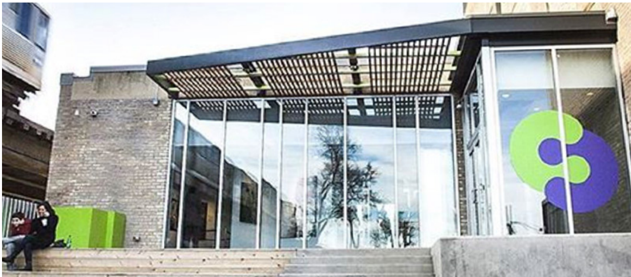
Chicago Center for Arts and Technology