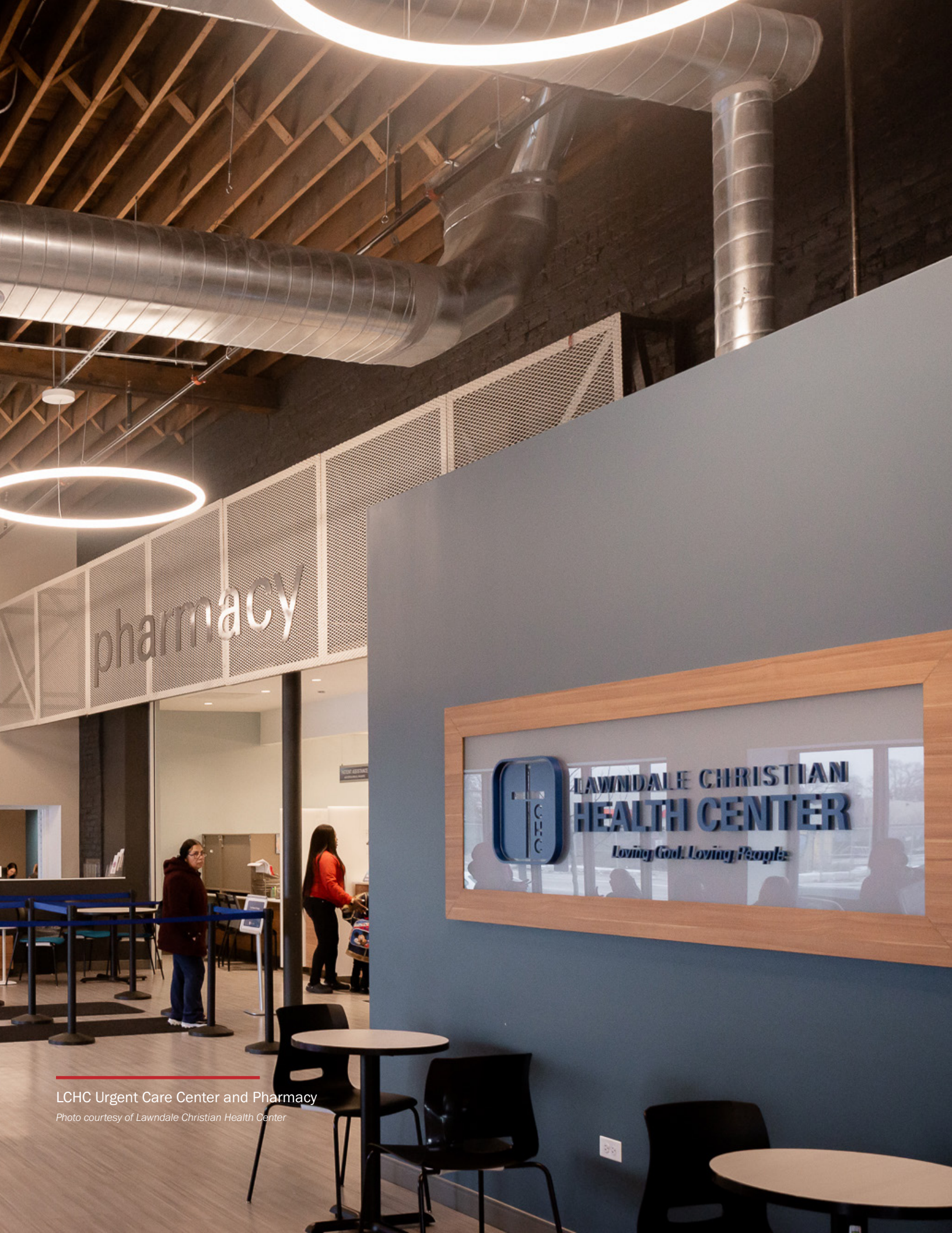
LCHC Urgent Care Center and Pharmacy