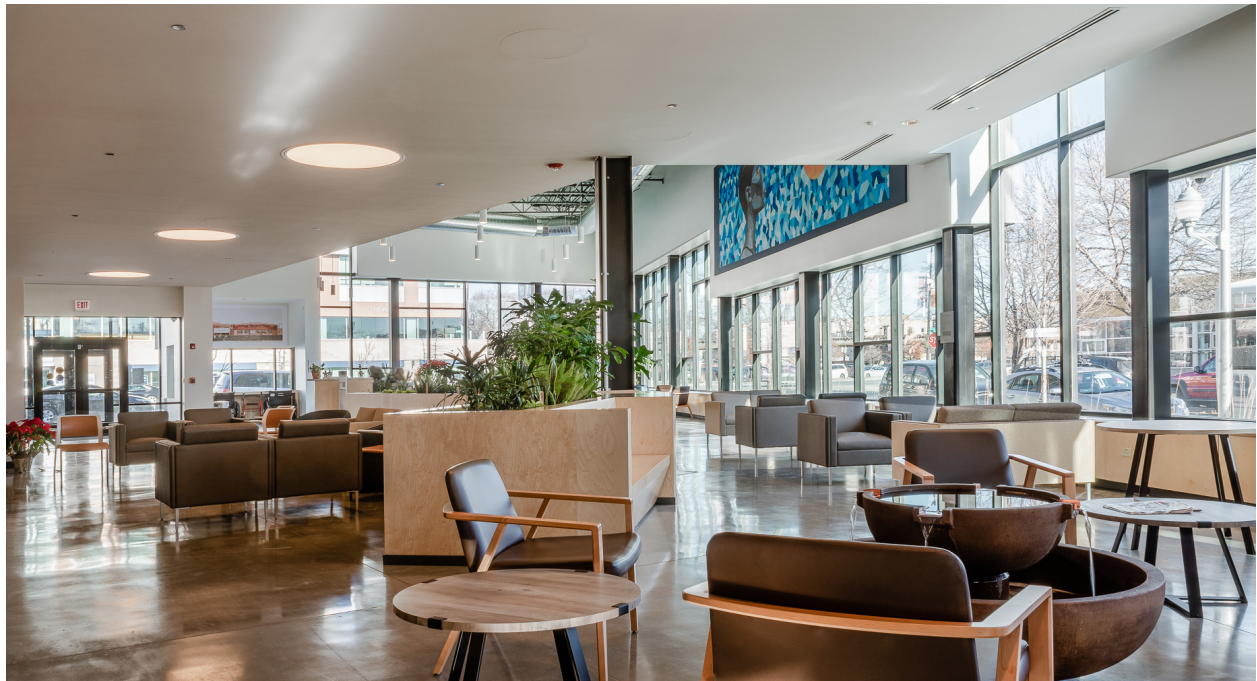
LCHC Adult Day Center

The Governing Board met on April 22, 2019.